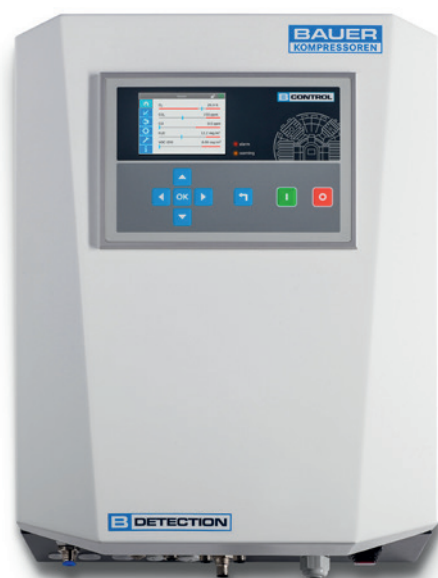
Standalone version: B-DETECTION PLUS s